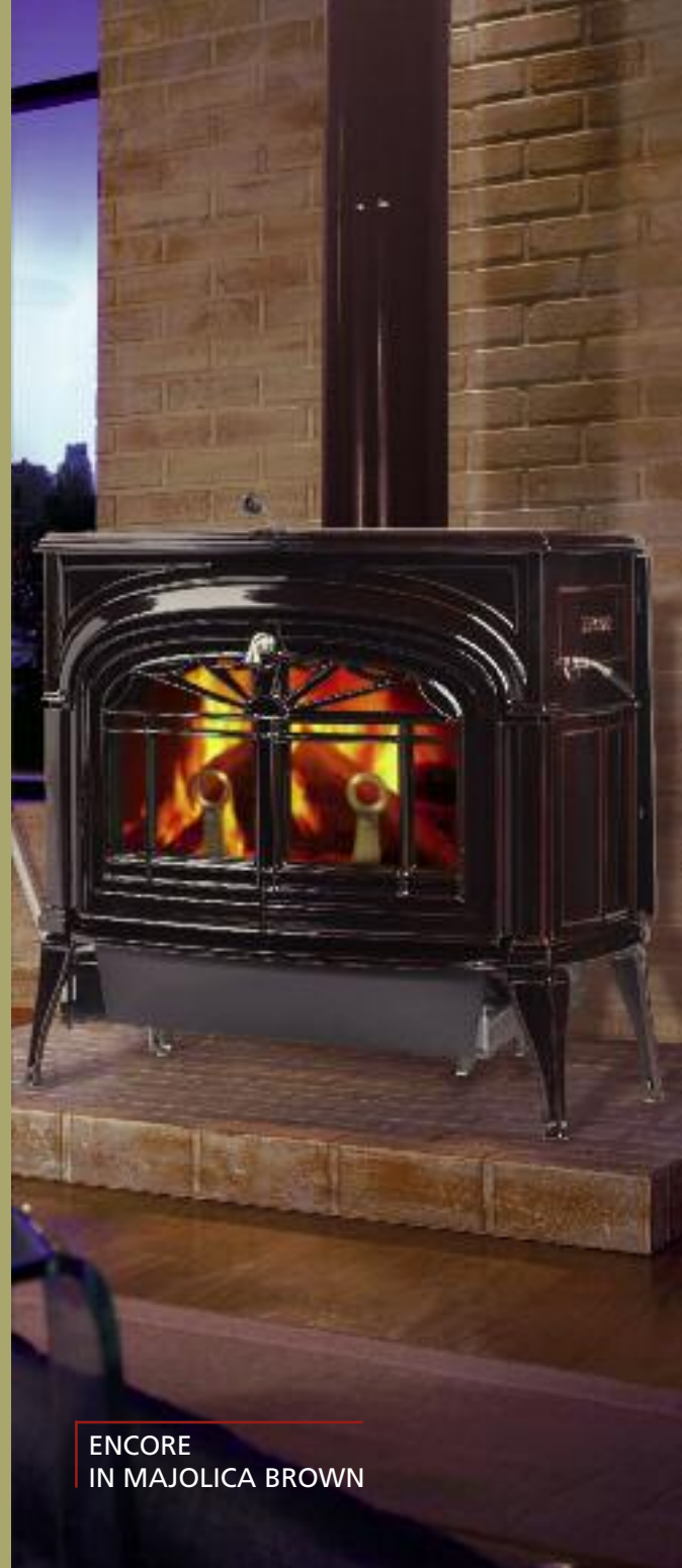
ENCORE IN MAJOLICA BROWN