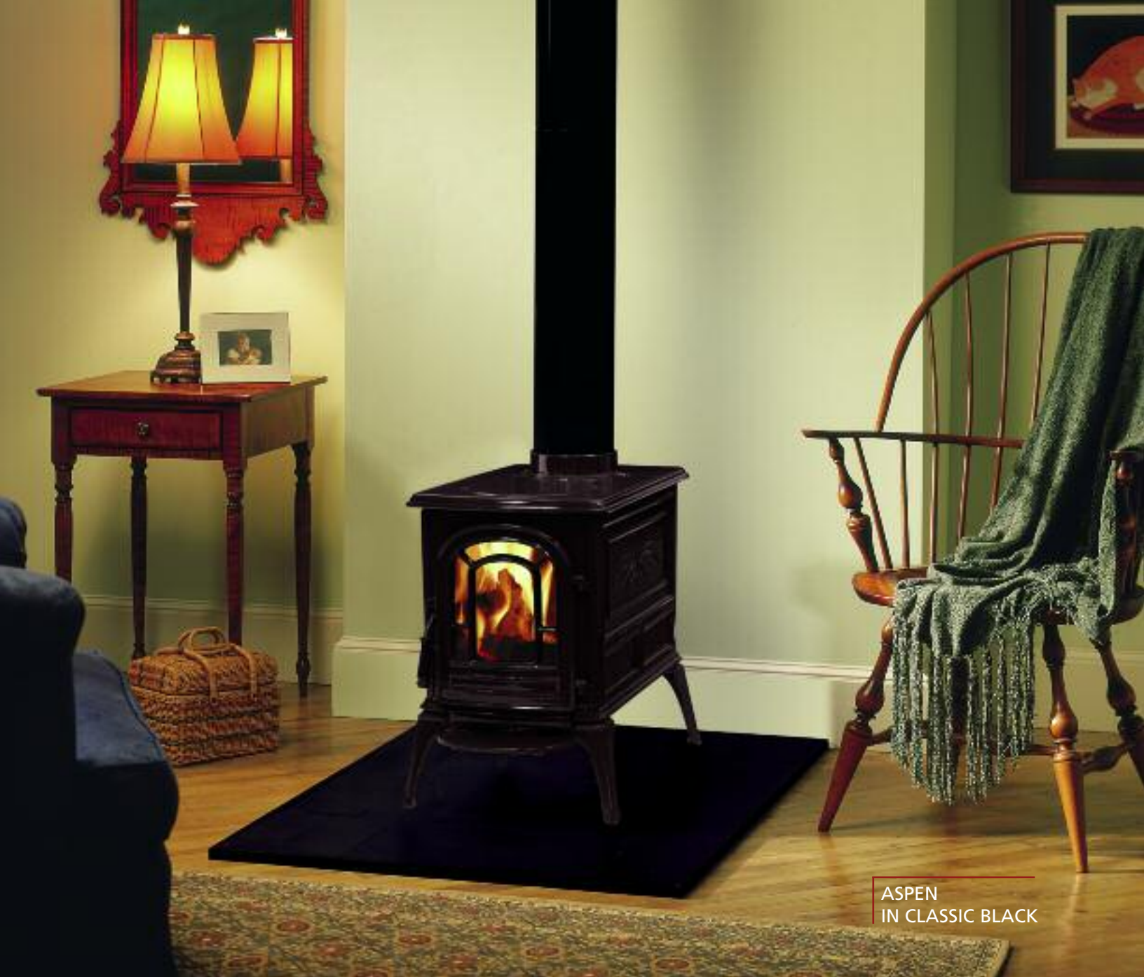
ASPEN IN CLASSIC BLACK