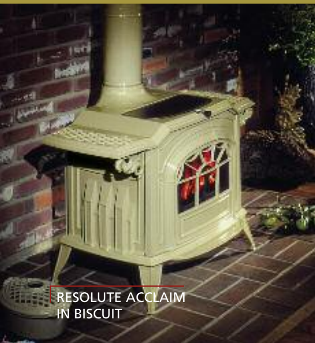
RESOLUTE ACCLAIM IN BISCUIT

With its compact size and optional short legs, the Intrepid II from Vermont Castings will fit just about anywhere! This compact catalytic wood stove offers high efficiency – more heat from less wood – as well as a clean burn, making it great for the environment as well. With a standard automatic thermostat and front or top loading convenience, the Intrepid II also offers optional warming shelves with mitten racks, a clearance reducing rear heat shield and your choice of classic Vermont Castings enamel colors. This beautiful little wood stove may be small in size, but it's certainly not short on style.