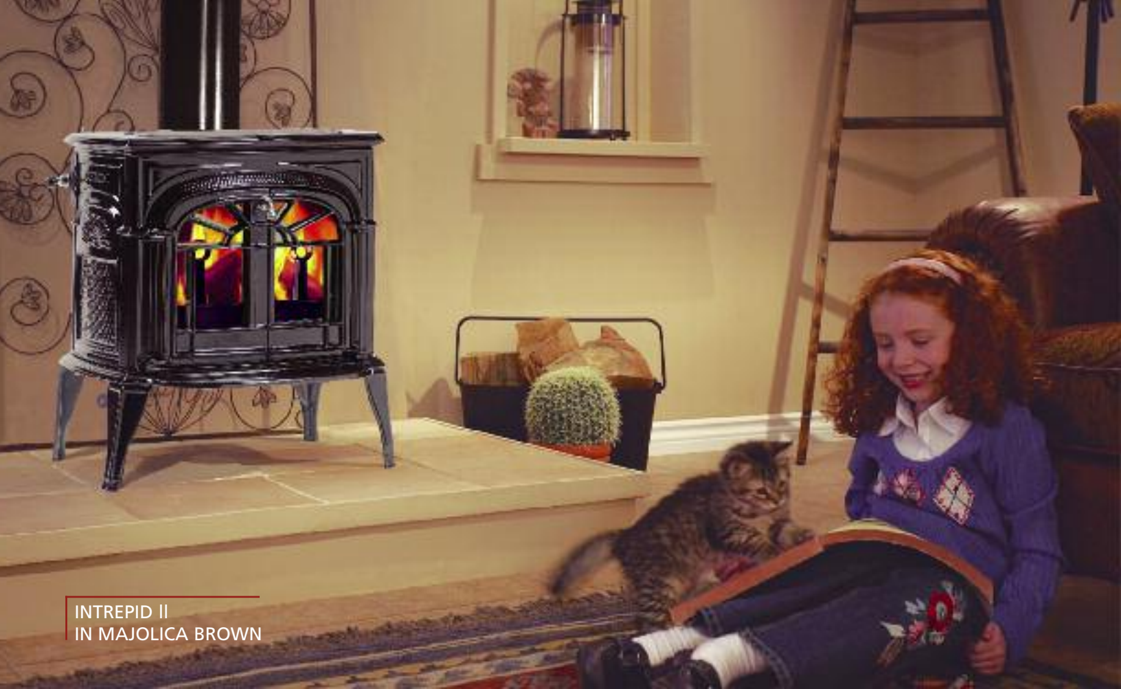
INTREPID II IN MAJOLICA BROWN